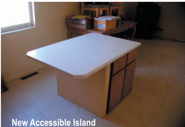
New Accessible Island