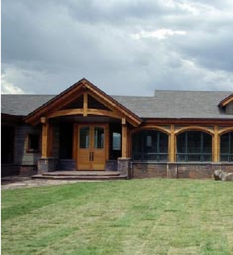
Haase Lodge Gunnison, Colorado