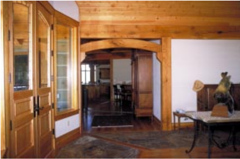
Haase Lodge Gunnison, Colorado